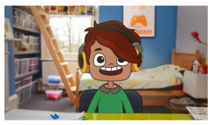
Tips&Tricks to beat the boss

• There are safe and unsafe things that someone can do when they are making and sharing photos videos online.